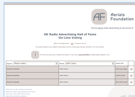
An HTML version was also created for optimum accessibility

To view the work: www.e-scapemedia.co.uk/halloffame