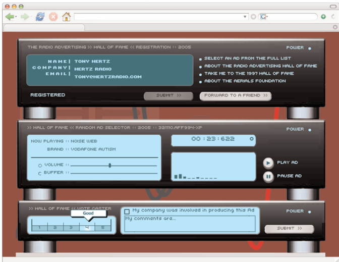
An interactive Flash interface was created to engage the audience

Our working relationship with the Radio Advertising Bureau goes back over six years and encompasses the successful delivery of many websites, e-marketing campaigns and interactive CD-ROMs. The RAB's in-house team uses our e-mail marketing platform and we provide hosting services for all online marketing. When the Internet Manager approached us with a challenge, we were naturally excited to get involved. The aim: to identify the "Top 30 radio adverts of the last 25 years" as voted for by the industry.